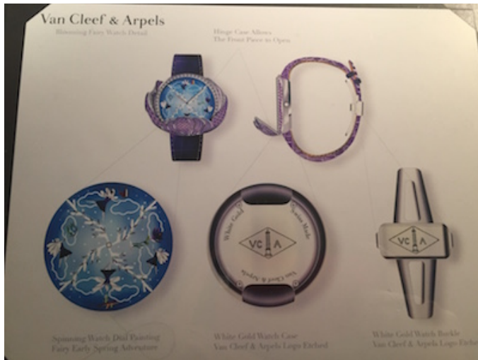
Projects from the past 10 years were on display

After the panel discussion, some of the most interesting projects from the past 10 years were on display. Each project had a small stand with a video telling the story of how it was created by the students and then implemented by the brand.