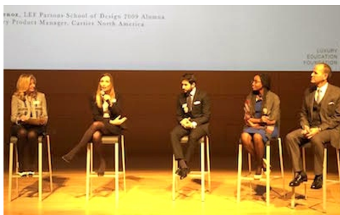
The panel included alumni and board members from LEF