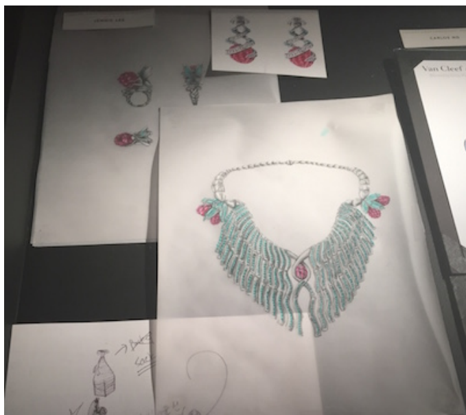
Sketches of various ideas and projects were also on display

In coming years the foundation hopes to expand its programs and offer students even more of the benefits it provides. It will continue to grow and work with more brands and teachers to educate the future leaders of the luxury industry.