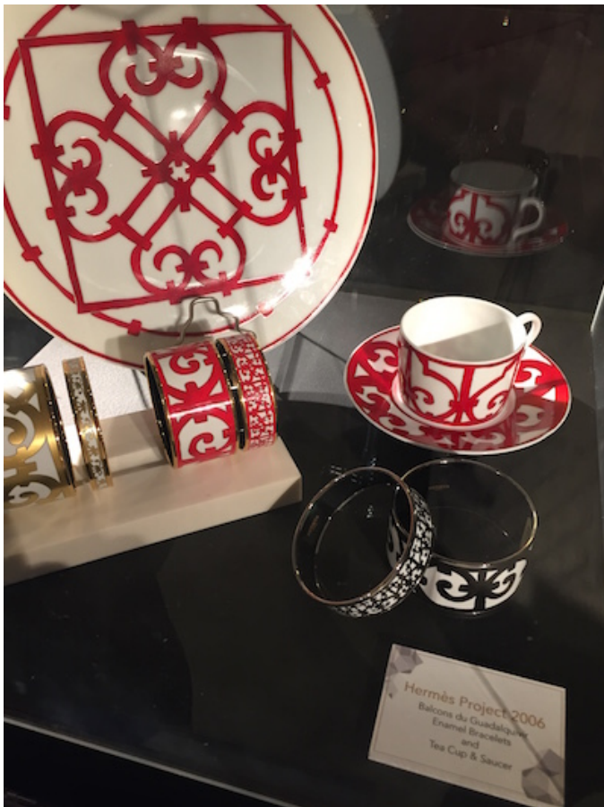
LEF students created an enamel bracelet for Hermès

The group of students with this assignment took a traditional Hermès china pattern and transformed it by applying it to a new line of enamel bracelets. Hermès was thrilled with their work and the bracelets are now available in stores.